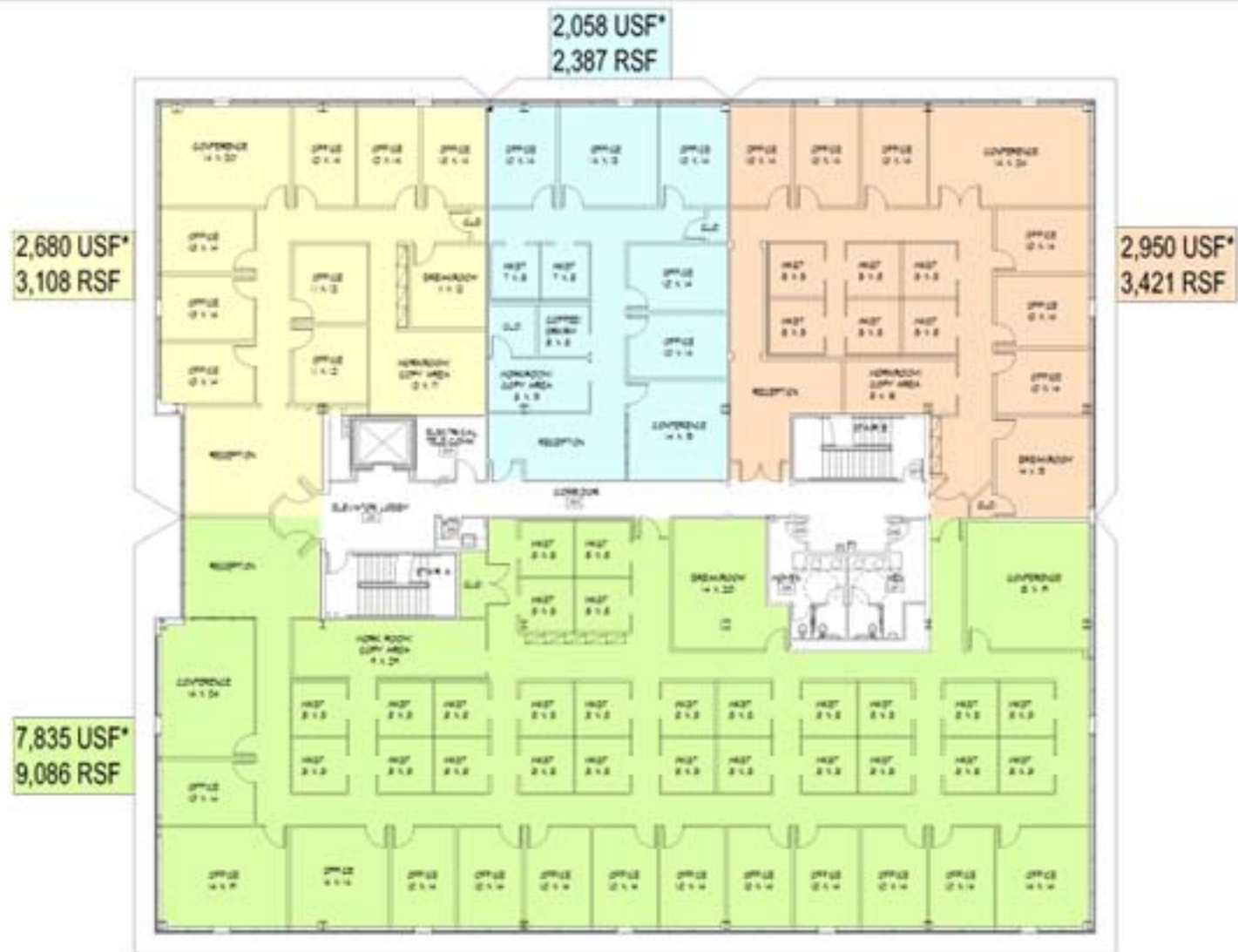
2ND FLOOR - SAMPLE LAYOUT PLAN