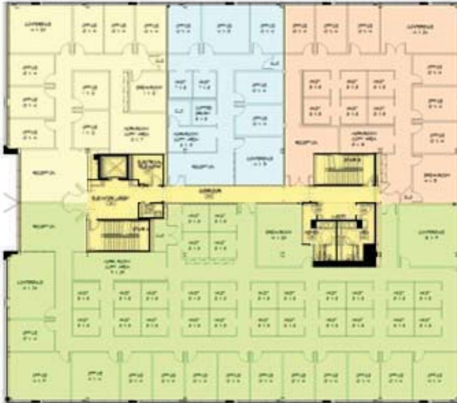
Sample Layout Floor Plan Approx. 18,000 RSF